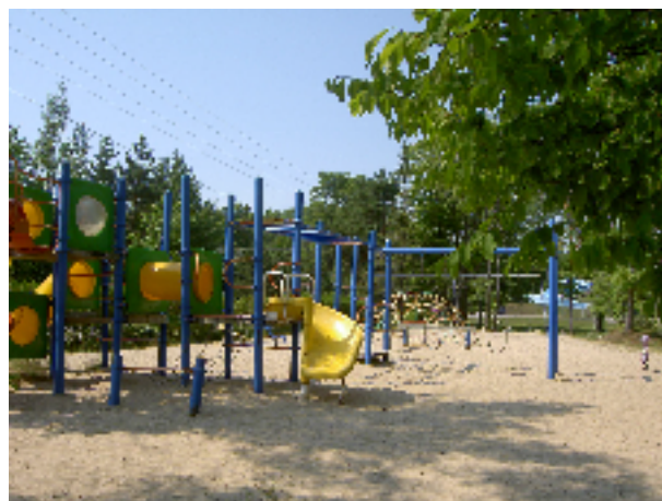
above - l: Ballfield; r. Playground - below ; l: Horseshoe and r. Open field