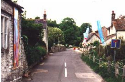
Church Street today, has not changed muchin over 100 years