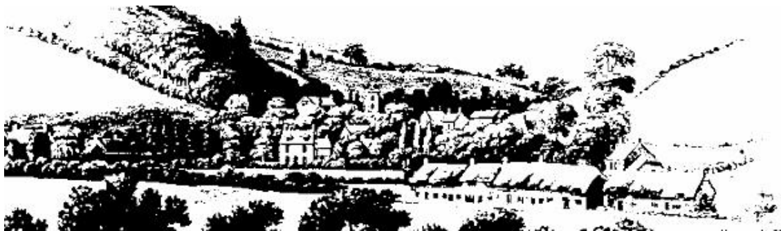
Upwey in 1818, a view of the village that intervening years have done little to modify 17